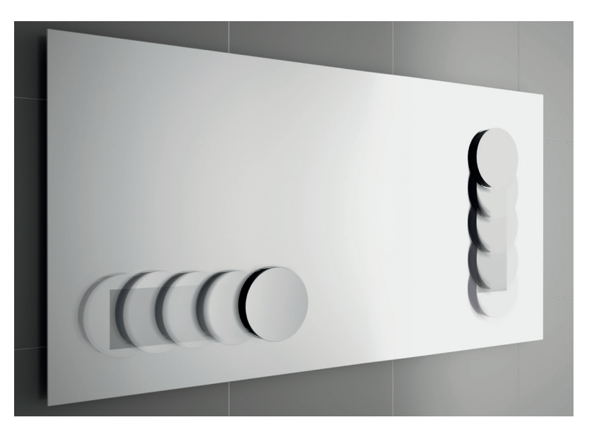
Once the back metal sheet is placed, the mirror can be moved, removed or placed in the position desired by the user.